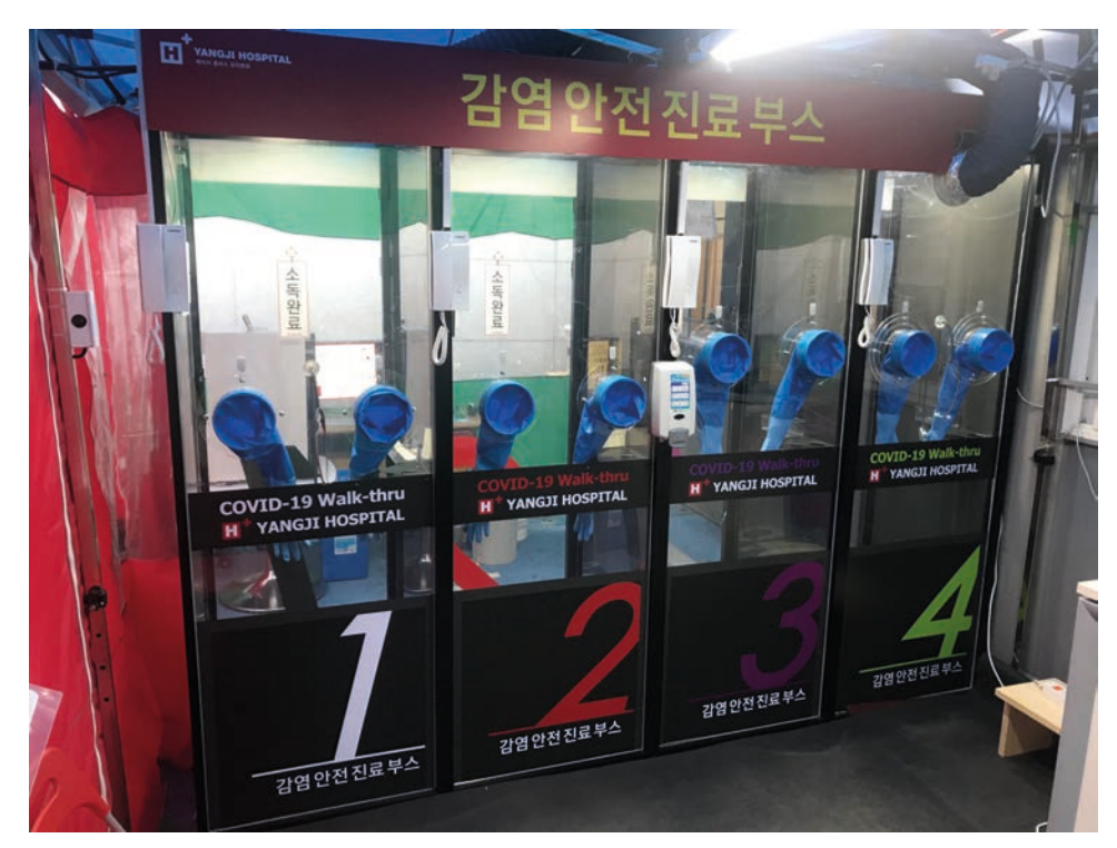
Fig. 2. Picture of Safe Assessment and Fast Evaluation Technical booth of the H Plus Yangji Hospital. The height of the glove hole in all booths is different.

glove entrance was different for each SAFETY, thereby allowing examination according to the patient's height ( Fig. 2 ). A stethoscope was installed on the glove wall. The interphone was installed inside the SAFETY so that the patient could communicate smoothly with the medical staff outside the booth. Sample collection kit, disposable tongue depressor, and medical pen light were provided. The patient's entrance was opposite the glove wall. The total cost to build a booth was approximately 2,400 dollars.