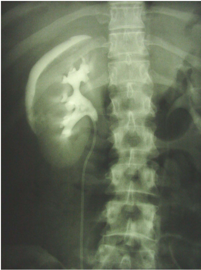
Figure 1 Abdominal plain radiograph with sickle-shaped perirenal contrast medium extravasation.

The iatrogenic caused fornix rupture through retrograde ureter manipulation is a rather rare or rarely diagnosed phenomenon, because after disobstruction of the upper urinary tract the rupture remains mostly asymptomatic. The urinary extravasation will be reabsorbed through the lymphatic system in the perirenal fat [3].