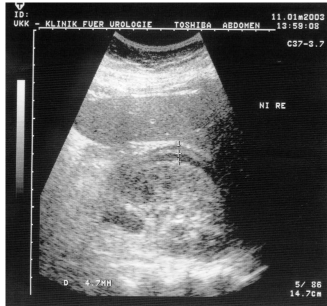
Figure 2 Ultrasound image of the right kidney with perirenal fluid extravasation within the Gerota's fascia.

Regular postoperative sonographic controls are absolutely necessary to diagnose an urinary extravasation in time to induce an appropriate therapy, especially if additive febrile symptomatic has become evident. Even in the case of a non-dilated upper urinary tract with a correct place-