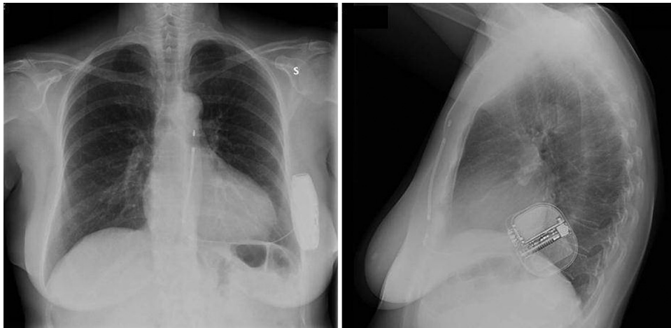
Fig. 2. Postoperative chest radiography, anteroposterior view and lateral view, confirming the final position of the lead and S-ICD pulse generator.