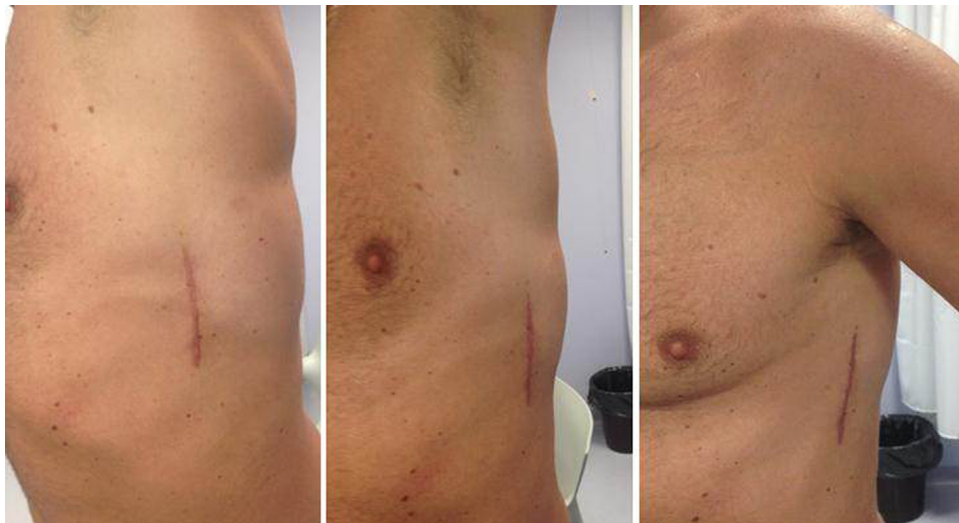
Fig. 3. Patient with intermuscular implantation of S-ICD pulse generator. The pictures show complete healing of the wound and effective concealment of the device.

cosmetic effect and allowing better device concealment. It seems likely that the favorable results in terms of infections, hematoma formation, or skin erosion will be maintained during long-term follow up because, as shown in FDA Investigational Device Exemption (IDE) and EFFORTLESS registry data, 40% of total complications with the S-ICD system occur within the first 30 days.