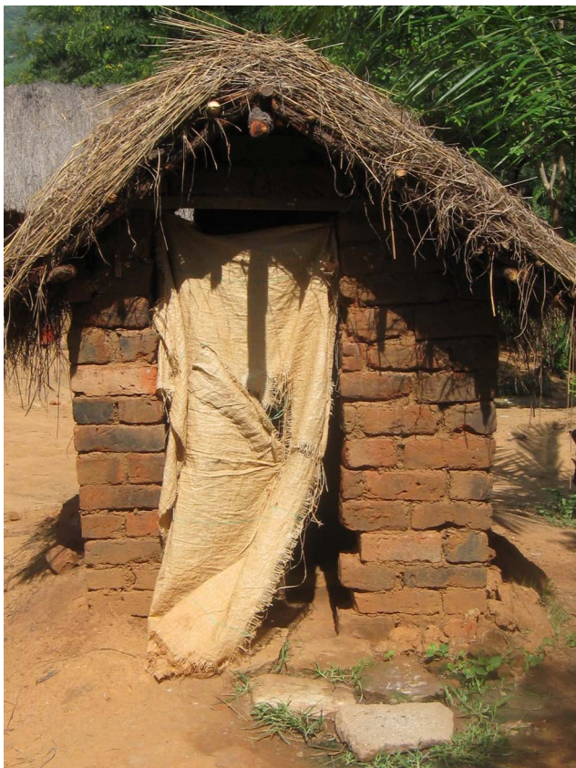
Figure 3 An improved form of sanitation: a household pit latrine in Tanzania.