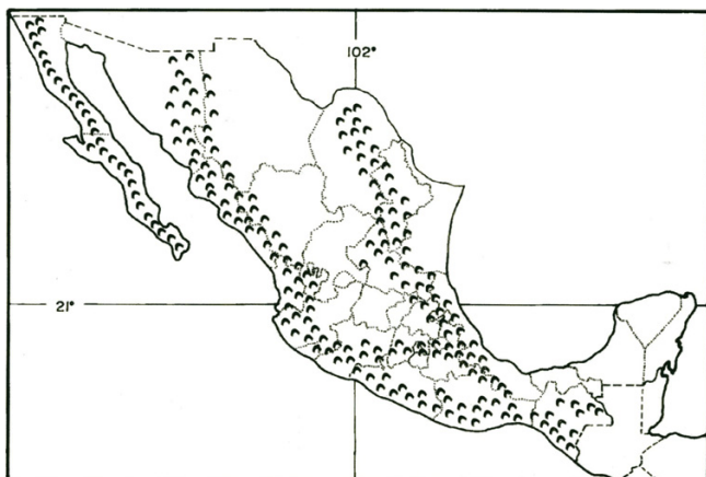
Figure 1 Orography of Mexican Republic.

Migration to the country's capital or abroad is a common phenomenon which must be considered in the present study [6]. Mainly young, male residents constitute the human capital of the community and abandon rural areas, leaving behind the elderly and children. This creates a new paradigm of concepts and values in the rural communities, which consequently drifts further away from tradition, and finally leads to a loss of traditional knowledge [6].