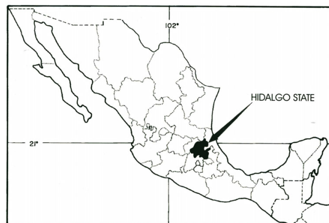
Figure 2 Geography situation of Hidalgo State in Mexican Republic.

Tulancingo, Hidalgo is a small town a few kilometers from Mexico City with 3,000 inhabitants of Nahuatl (2/3) and