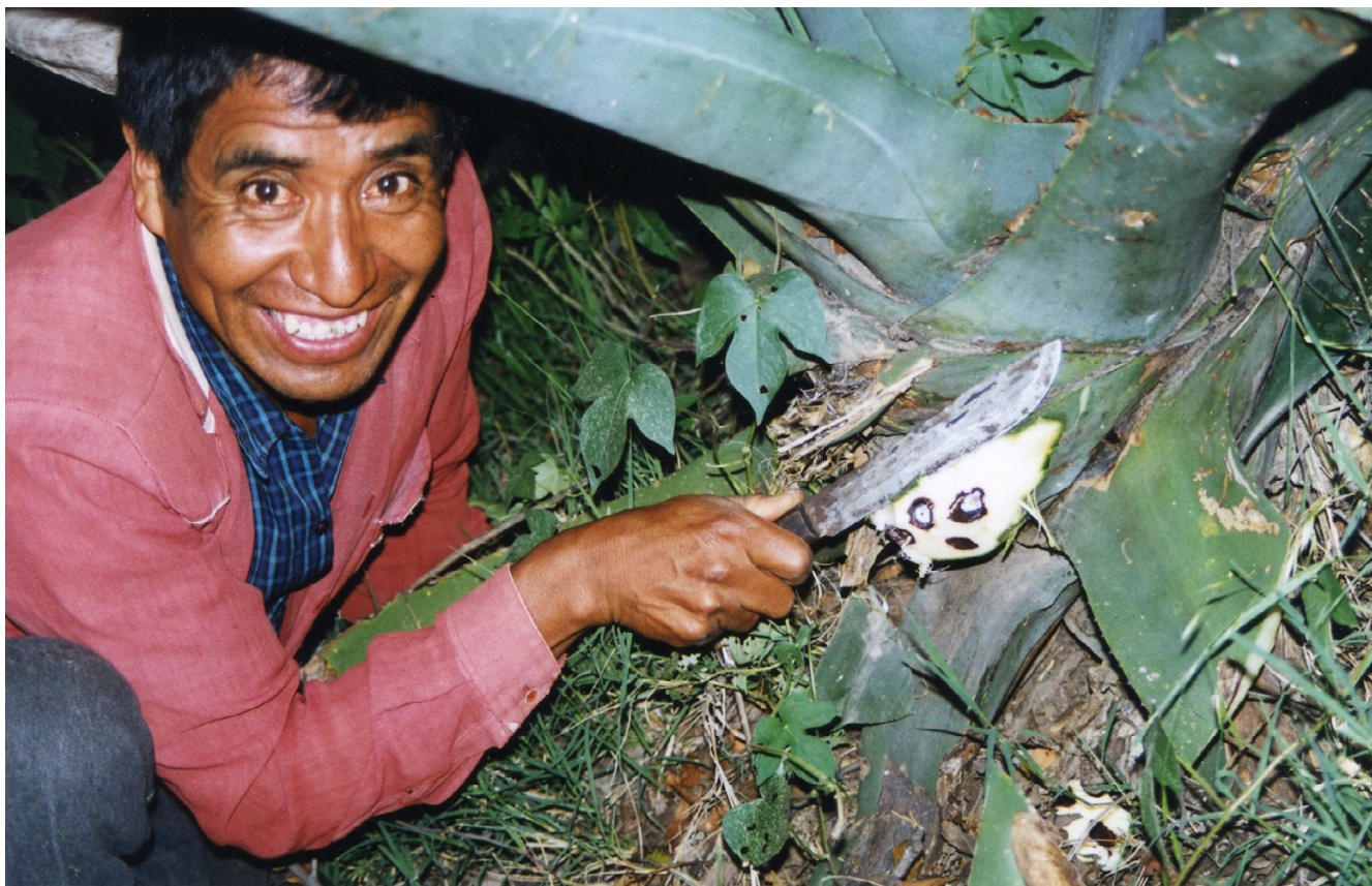
Figure 4 Peasant cutting fleshy leaf of an agave plant.

ers ( Melanoterpes sp.) which drill into wood and then arrive sow bugs (Crustacea, Isopoda), to eat the larvae. Afterwards a mealybug ( Pseudococcus sp.) that found favorable conditions to develops inside the gallery, penetrate together with different species of ants ( Formica sp., Camponotus sp., Myrmecosistus spp.) that feed on the secretions of this mealybug, favoring also the growth of mushrooms and bacteria that causes diseases.