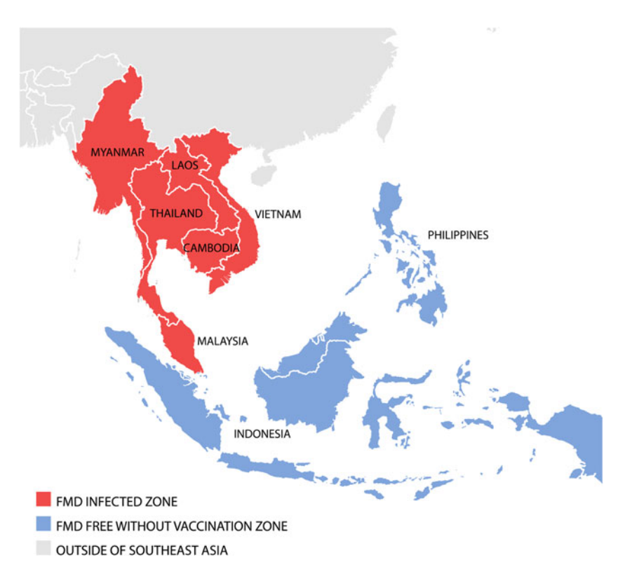
Fig. 1. Map of SEA indicating FMD disease status.

these lineages arose from a common ancestor approximately 35 years ago [4]. Viruses belonging to the O/SEA/Mya-98 lineage have been detected in all six countries of continental SEA over the past 15 years, while the O/SEA/Cam-94 lineage was only identified between 1989 and 2003 and may be considered extinct [4].