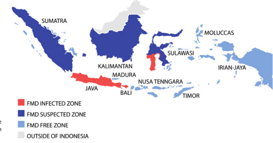
Fig. 2. Map demonstrating the progressive vaccination zones use during the Indonesian FMD eradication campaign. Adapted from Soehadji et al. [60].

possible disease carriers. Vaccination coverage was estimated to involve at least 80% of the livestock population. Vaccinated animals were identified by ear markings and there was a strict control of livestock vehicles to minimise animal movement into the vaccination area. Intensive epidemiological surveillance was performed continuously during the programme to monitor the possible reappearance of cases, and after 3 years, many regions were declared free of FMD.