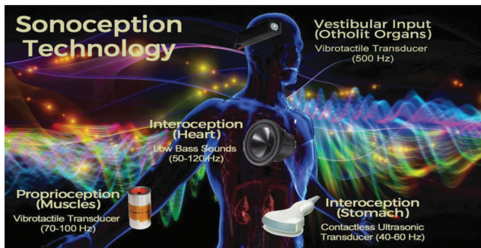
FIG. 2. The technology of “sonoception.”

According to neuroscience, to regulate and control the body in the world effectively, the brain creates an embodied simulation of the body in the world used to represent and predict actions, concepts, and emotions. Specifically, it is used to predict: (a) upcoming sensory events both inside and outside the body, and (b) the best action to deal with the impending sensory events. 100 There are two main characteristics of this simulation. First, it simulates sensory motor experiences, including visceral/autonomic (interoceptive),