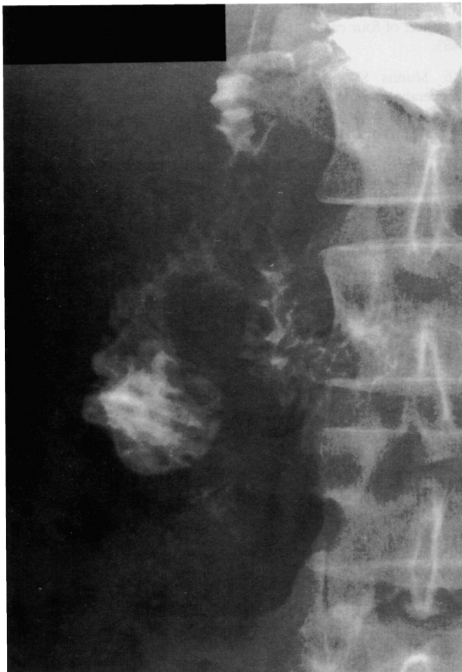
Figure 3. Upper gastrointestinal series demonstrating a patent duodenojejunostomy with flow of contrast past the stapled anastomosis.

actual incidence is largely unknown since its diagnosis is not frequently pursued in the chronically ill.