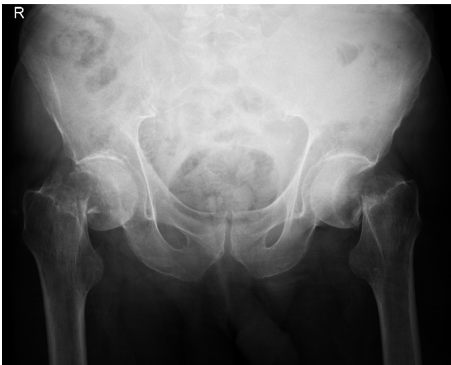
Figure 1 Anteroposterior radiograph of the pelvis showing bilateral completely displaced intracapsular fractures of the neck of femur.

Uncomplicated trauma is a rare cause of bilateral fractured NOF [6]. There have been reports of bilateral NOF fractures after seizures secondary to epilepsy, drugs, and electrocution [6]. Intracapsular fractures of the NOF prior to the fifth decade of life usually result from severe injury [5]. Konforti et al [7] described bilateral NOF fractures in a 37-year-old gentleman crushed during a mining acci-