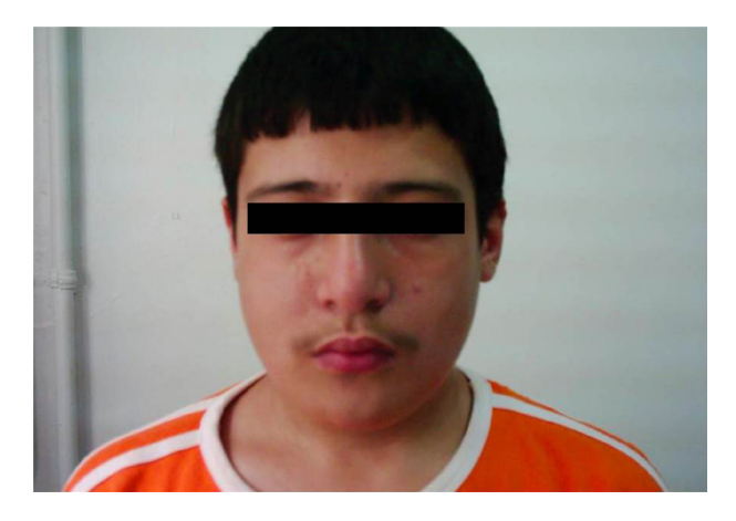
Figure 3 Characteristic facial features might not be recognized easily. Notes: Prominent nose with a bulbous tip, small mouth and eyes, and long face in a patient diagnosed with 22q11DS. He also had hypoparathyroidism and attention deficit.

Renal problems are frequent in patients with 22q11DS, including structural renal anomalies such as renal agenesis or dysplastic kidneys, obstructive abnormalities, and vesicoureteric reflux.<sup>2,3,30–33</sup> Morphological and functional thyroid alternations have also been reported. Thyroid hypoplasia is common, but hypothyroidism is rare in 22q11DS.<sup>52</sup> Gastrointestinal involvement is observed sometimes in patients, including gastroesophageal reflux, chronic constipation, abdominal pain, and vomiting. However, intestinal