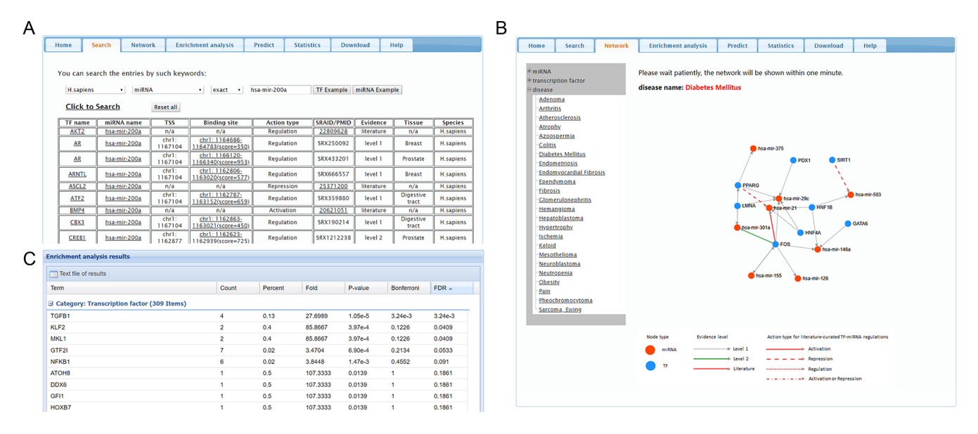
Figure 2. The sample results of TransmiR v2.0 database. (A) The sample database query (by TF or miRNA) result. (B) The sample network view of TF-miRNA regulations. (C) The sample tabular view of enrichment analysis result (sorted by FDR).

the increased amount of c-Fos in diabetic patients. And this regulation may play an important role in insulin signaling. For example, the defects of PPAR-gamma were suggested to be associated with increased risk of type 2 diabetes (43), but the underlying mechanism was unclear. We noted that PPAR-gamma is capable to decrease the transcriptional activity of c-Fos (44). Therefore, one plausible mechanism would be that the defects of PPAR-gamma might cause the