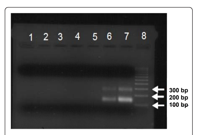
Figure 3 Agarose gel electrophoresis of cfDNA from severe sepsis patients. cfDNA was purified from 250 µl of plasma, as described in Materials and methods, and 16 µl was loaded per lane. Lanes 1 to 5, cfDNA from severe sepsis patients (survivors); lanes 6 and 7, cfDNA from severe sepsis patients (nonsurvivors); lane 8, 100-bp DNA ladder.

We demonstrated that the AUC for cfDNA to predict ICU mortality was 0.97 (95% CI, 0.93 to 1.00), suggesting that cfDNA isolated from plasma is a superior discriminator compared with other scoring systems and/or biomarkers [11,25,39,40]. We also studied the time-dependent changes in cfDNA in our sepsis patients. Sequential measurement of cfDNA levels revealed that no overlap occurs in cfDNA levels between survivors and nonsurvivors during the course of the patients' stay in the ICU. This raises the possibility that at a very early stage in severe sepsis,