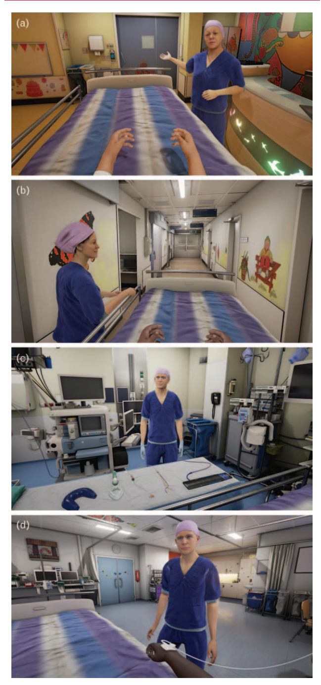
Virtual reality environment. (a) The receptionist welcomes the child to the holding area. (b) The operating room, where the child receives information about different instruments (pulse oximeter, blood pressure cuff and anaesthesia mask). (c) The child wakes up in the recovery room.

explains what kind of feelings the child might experience after surgery, for example nausea. For a more detailed overview of the storyline, as well as the technical hardware and software specifications, we refer to the trial article.<sup>16</sup>