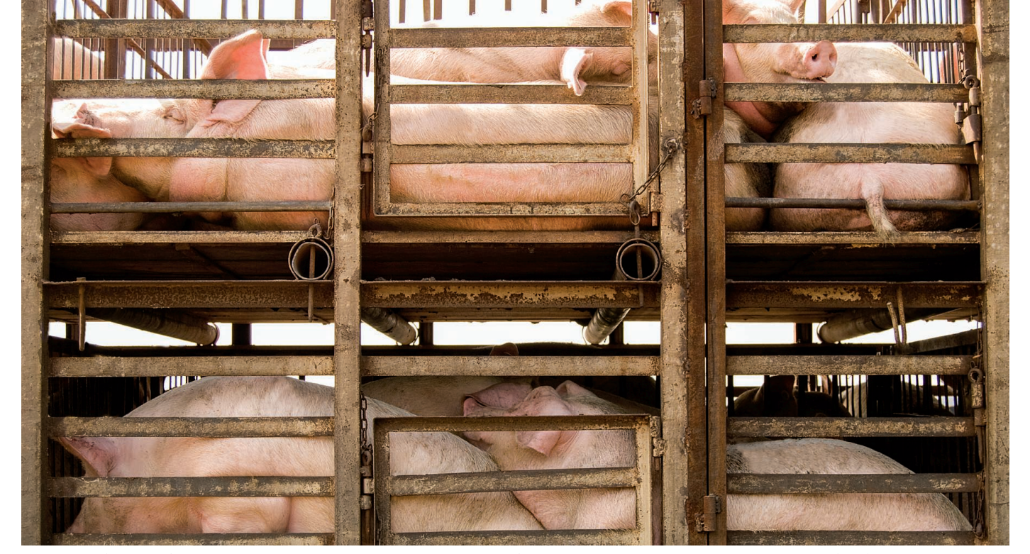
Pigs in cages, Quanzhou, China. As the largest consumer of veterinary antimicrobials, China is critical for combating antimicrobial resistance (AMR).

[118 mg/PCU and 133 mg/kg, respectively (14)], but given that the biomass of animals raised for food exceeds by far the biomass of humans, new resistant mutations are more likely to arise in animals. Furthermore, a central distinction between animals and humans is the purpose of antimicrobial use. Unlike in humans, antimicrobial use in animals is primarily intended for growth promotion and mass prophylaxis. These uses are often administered both through feed, directly targeting the gut, and in low-dose patterns that promote the evolution of resistance (15). These factors suggest that the food animal reservoir is a greater source of resistance genes than humans. However, the subsequent spread of those genes to humans follows complex pathways, and recent work has highlighted that curtailing antimicrobial use in animals alone will not suffice to contain AMR in humans (16).