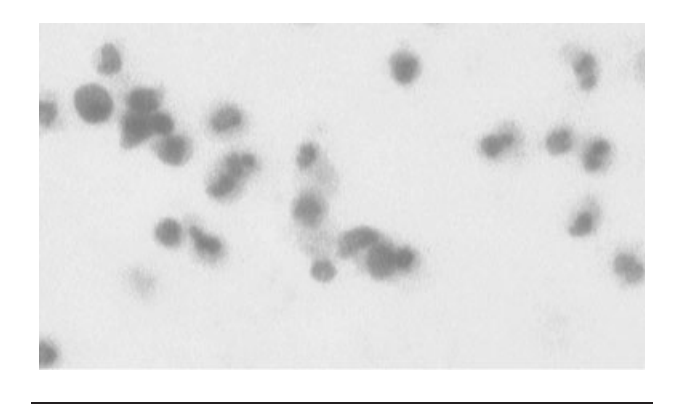
Figure 2. Microscopic appearance of a cuvette filled with a blood sample. (×40) Photographed on a conventional light microscope (Nikon E400; Nikon Electronic Company, Osaka, Japan).