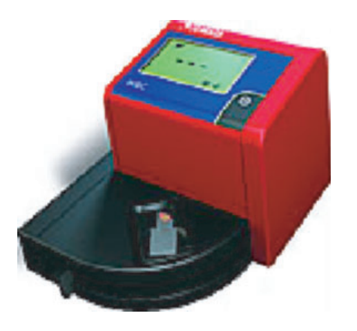
Figure 1. Photograph of the portable HemoCue WBC Point-of-care analyser (plastic cuvette containing a drop of blood is shown placed on the circular base holder).

This study was undertaken to assess the reliability and clinical utility of the device in accordance with the recommendations of the International Council for Standardization in Haematology (1994) and taking account of the requirements established by UK NE-QAS that for the WBC counts to be acceptable the results must be within 8–10% of assigned values