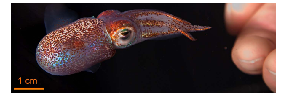
Figure 1. The adult host Euprymna scolopes , the Hawaiian bobtail squid. The human hand at the right offers an idea of the animal size. doi:10.1371/journal.pbio.1001783.g001

Research of the squid-vibrio model has also been pushed along by its close tracking of tool development in imaging, genome sequencing, and functional genomics. By the mid to late 1990s, research on the system was well underway, with the ultrastructural relationships between the host tissues and its symbiont defined in both juvenile and adult animals [15,16]. The application of confocal microscopy, which had just become broadly available, revealed important details of the 3-dimensional organization of the system, and allowed the visualization, in real time, of